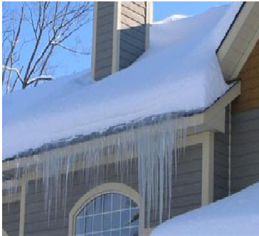
Visible ice damming — ice layer under snow and heavy icicles

In our climate it is often difficult to estimate a home's reaction to the vagaries of weather. The snow may be gone but, the damage remains. Show your clients that you have their best interests in hand, regardless of the season.