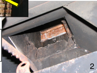
Chimney missing the flue.